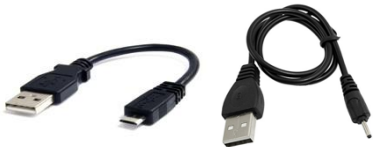
2 cables (1 jack charger, 1 micro USB cable)