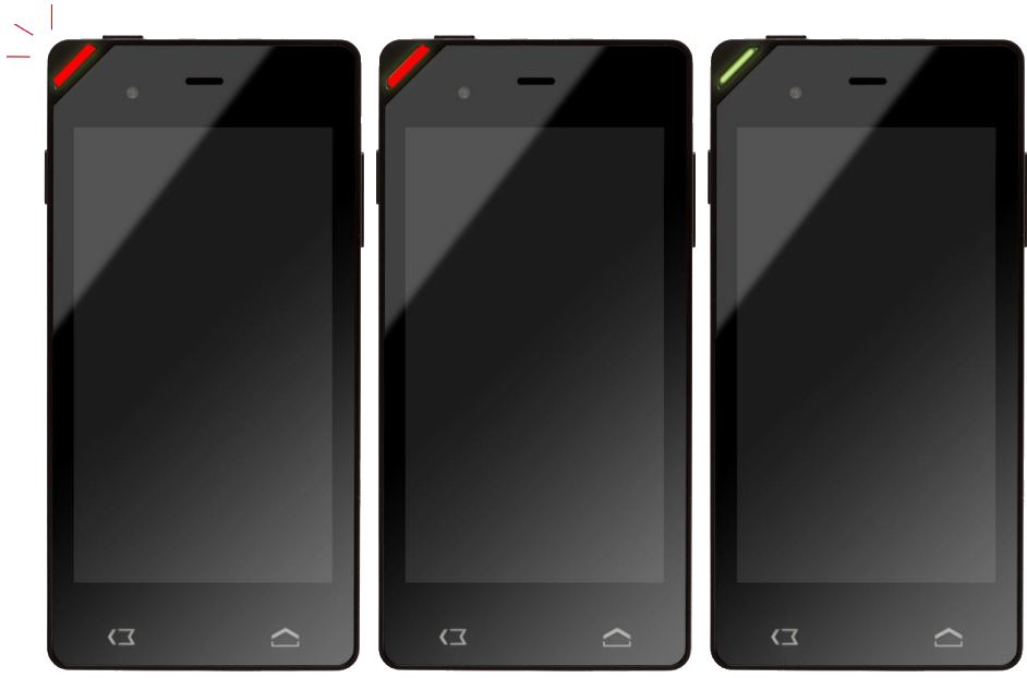
Blinking red Low battery

The LED on the device can show different colors. Those colors are defined by the application but there are default features: