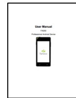
1 User manual